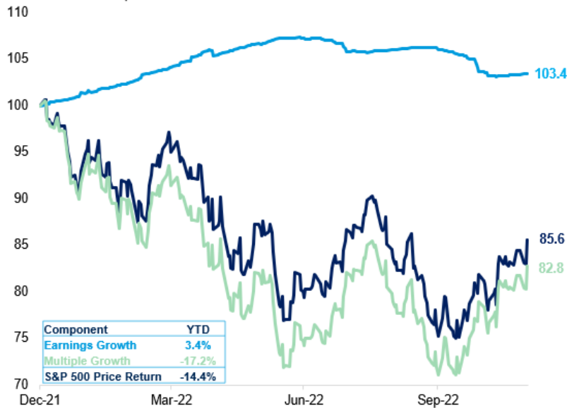
S&P 500 Index Decomposition

Price multiple declines often lead earnings while bear markets unfold as is the case this year. Multiples have contracted, but earnings, at the surface have remained modestly positive. However, if we dive deeper, strength in the energy sector (over 100 percent earnings growth so far in 2022) is buoying the rest of the market.